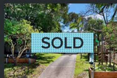
67 Mons Avenue 3 bed, 1 bath, 3 car CONFIDENTIAL