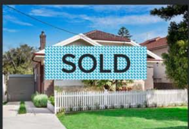
65 Haig Street 3 bed, 1 bath, 2 car SOLD PRIOR