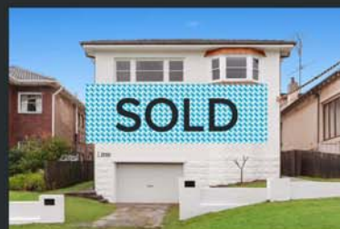
7 Inman Street 4 bed, 2 bath, 2 car SOLD PRIOR