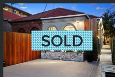
47 The Causeway 3 bed, 2.5 bath, 2 car SOLD PRIOR

Phillips Pantzer Donnelley has already sold 222 properties in the first 151 days of 2018. Despite some media reports of a declining market our buyer engagement remains strong, to date we have met a total of over 13,161 buyers and have issued over 968 contracts. Our average days on market sits at only 21 compared to the Eastern suburbs average of 46 with our auction clearance rate of 93.1% well above the Sydney average of 66%. Why would you list with anyone else?