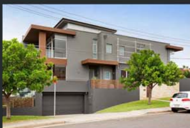
9 Torrington Road 4 bed, 3 bath, 2 car FOR SALE