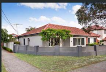
47 Wild Street 2 bed, 1 bath, 2 car FOR SALE