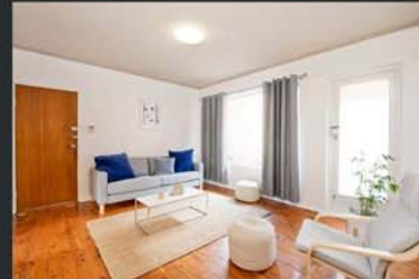
3/901 Anzac Parade 2 bed, 1 bath, 1 car JUST LISTED