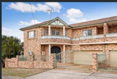
1 Everett Street 3 bed, 2.5 bath, 3 car JUST LISTED