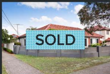
47 Wild Street 2 bed, 1 bath, 2 car FOR SALE