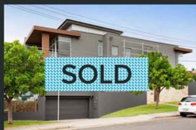
9 Torrington Road 4 bed, 3 bath, 2 car FOR SALE