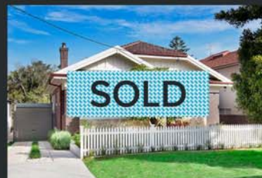
65 Haig Street 3 bed, 1 bath, 2 car SOLD PRIOR

Phillips Pantzer Donnelley has already sold 257 properties in the first 178 days of 2018. Despite some media reports of a declining market our buyer engagement remains strong, to date we have met a total of over 14,6600 buyers and have issued over 1,065 contracts. Our average days on market sits at only 21 compared to the Eastern suburbs average of 46 with our auction clearance rate of 93.7% well above the Sydney average of 66%. Why would you list with anyone else?