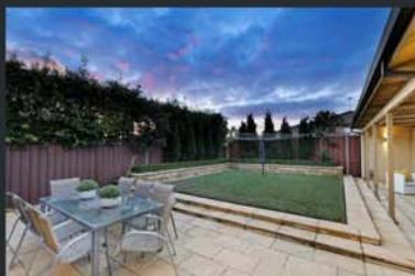
36 Fitzgerald Avenue 4 bed, 1.5 bath, 3 car JUST LISTED