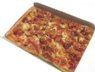
BBQ Meat Lovers Stone Baked Pizza with a Juice Box $6