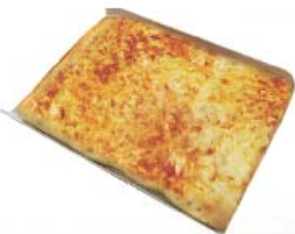
Margherita Cheese Stone Baked Pizza with a Juice Box $6

If you have any dietary requirements, please discuss with Canteen Staff by Friday Please not normal Canteen Menu will not be available on this day.