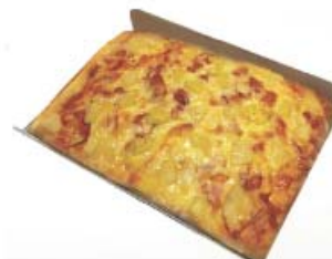
Ham, Cheese & Pineapple Stone Baked Pizza with a Juice Box $6

Anthony Catering thanks you all for your support this year.