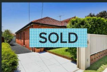
86 Holmes Street 4 bed, 2 bath, 3 car SOLD IN 12 DAYS