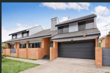
2 Percival Street 4 bed, 3 bath, 2 car FOR SALE