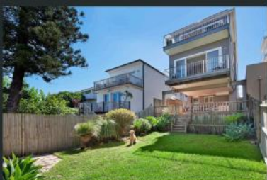
9 Bellevue Street 5 bed, 3 bath, 1 car JUST LISTED