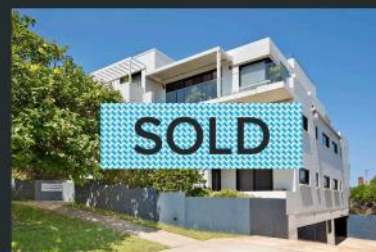
6/9-11 Beaumont Avenue 2 bed, 2 bath, 1 car SOLD IN 16 DAYS

Our advice to any owners considering selling in 2019 is to come to market as soon as possible, inspection numbers and buyer enquiry levels have tripled since December last year. Phillips Pantzer Donnelley have already sold 26 properties since January 1, with a value in excess of $55.797 million, coordinated over 535 open homes, met over 3,912 active new buyers and issued over 249 contracts. We are miles ahead of any other agency and are the safest option in a changing market. If you have any questions regarding the sale process, your property, or the property market in general, please feel free to call us on the numbers below. We look forward to working with you and assure you of our 100% commitment at all times.