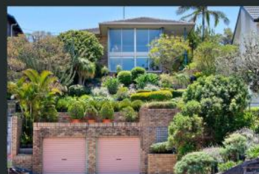
338 Maroubra Road 5 bed, 2 bath, 4 car FOR SALE