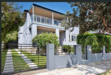
1 Torrington Road 5 bed, 4 bath, 4 car JUST LISTED