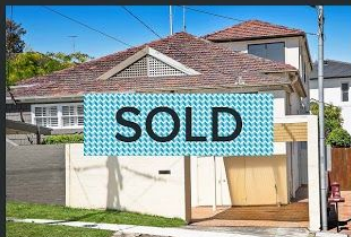
4 Ellen Street 3 bed, 2 bath, 1 car SOLD PRIOR