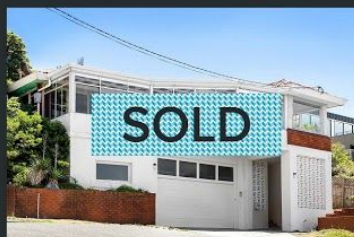
5 Ahearn Avenue 3 bed, 2 bath, 2 car SOLD PRIOR