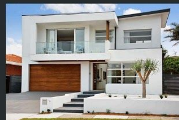
10 Molloy Avenue 5 bed, 3 bath, 4 car JUST LISTED