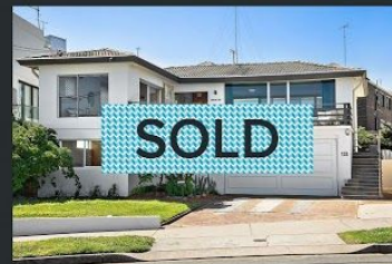
132 Marine Parade 4 bed, 2 bath, 2 car SOLD AT AUCTION

RANKED #1 AGENT IN MAROUBRA BY RATEMYAGENT.COM.AU