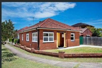
17 Chichester Street 3 bed, 1 bath, 1 car JUST LISTED