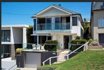
5 Cairo Street 5 bed, 4 bath, 2 car JUST LISTED