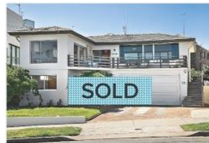
132 Marine Parade MAROUBRA