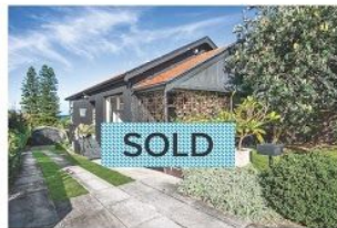
5 Wilson Street MAROUBRA