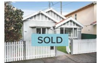
75A Boyce Road MAROUBRA

This year we have already sold 312 properties with a value in excess of $776 million , coordinated over 3,495 inspections , met over 20,036 active new buyers and issued over 1,550 contracts . We are miles ahead of any other agency and are the safest option in a changing market.