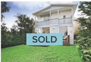
2 White Avenue MAROUBRA