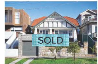
22 EVERETT STREET MAROUBRA

This year we have already sold 591 properties with a value in excess of over $1.764 billion , coordinated over 7,830 inspections , met over 29,843 active new buyers and issued over 2,982 contracts . We are miles ahead of any other agency and are the safest option in a changing market.