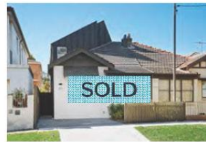
89 ROBEY STREET MAROUBRA