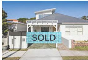
89 PAINE STREET MAROUBRA