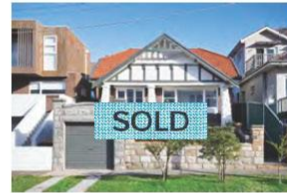
22 EVERETT STREET MAROUBRA

This year we have already sold 591 properties with a value in excess of over $1.764 billion , coordinated over 7,830 inspections , met over 29,843 active new buyers and issued over 2,982 contracts . We are miles ahead of any other agency and are the safest option in a changing market.