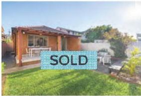
54 ALMA ROAD MAROUBRA