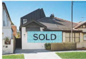
89 ROBEY STREET MAROUBRA