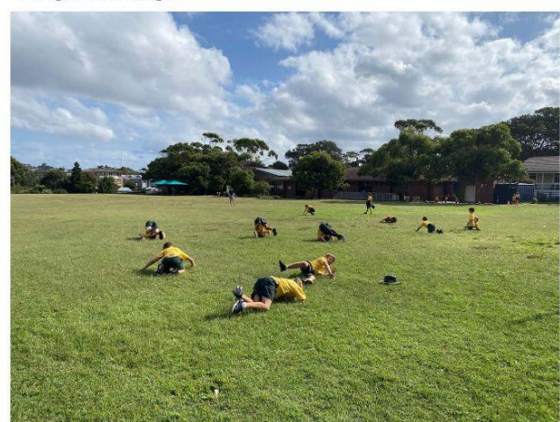
MAROUBRA BAY CHALLENGE

"Tell me and I forget. Teach me and I remember. Involve me and I learn."