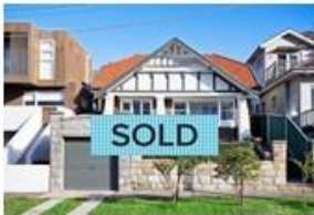
22 Everett Street MAROUBRA