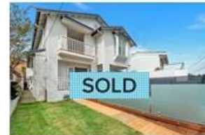
5 White Avenue MAROUBRA

This year we have already sold 473 properties with a value in excess of over $1.375 billion , coordinated over 4,050 inspections , met over 25,705 active new buyers and issued over 2,251 contracts . We are miles ahead of any other agency and are the safest option in a changing market.