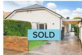
26 Gale Road MAROUBRA