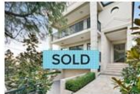
54 Boyce Road MAROUBRA