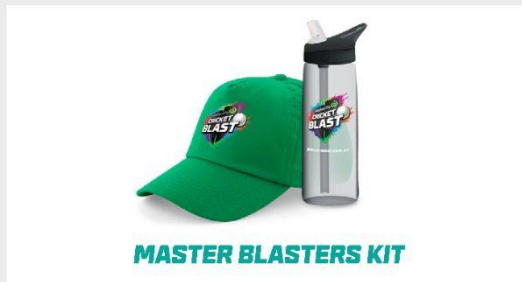
MASTER BLASTERS KIT